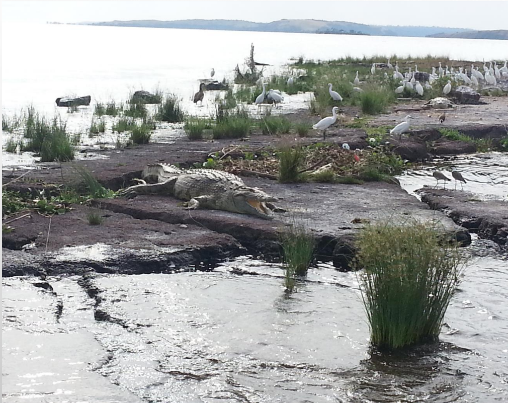
CROCODILE IN LAKE VICTORIA – RESTING IN A GUARDED ENVIRONMENT AGAINST ILLEGAL FISHERMEN