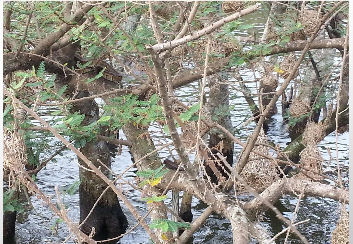
PYTHONS OF LAKE VICTORIA – FEEDING ON BIRDS

THESE SPECIES WILL COLLIDE WITH HUMANS IF FOOD GET SCARCE